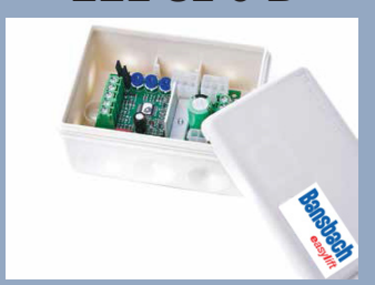
(Box) 102 x 73 x 47 mm (L x B x H)